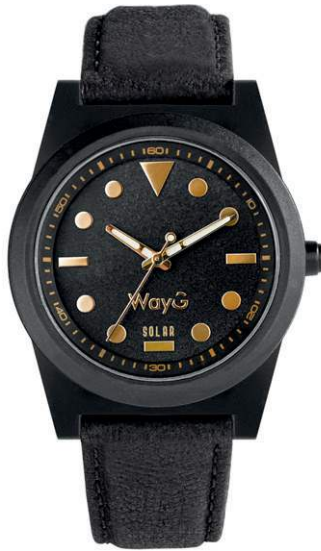
WayG Black S01