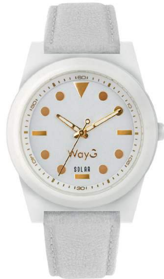
WayG White S02